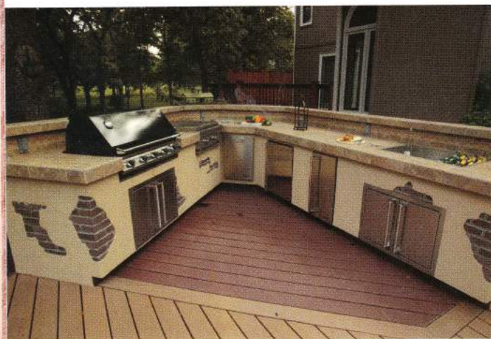
By Brooke Pearl

The 1,700-square-foot deck, with Trex tops and flooring (in different colors and angles) and cedar posts, includes three levels, four staircases, an outdoor kitchen, fire pit, benches and a bar rail. It's adorned with colorful built-in planters to brighten the space,